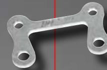
SRC-2805 Left Front Caliper Mount for 10 7/8" Rotor - Non Countersunk