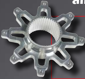
SRC-2930 Floater Style Splined Rear Inboard Rotor Mount - 1 pc.

DMI's new SRC-2932 Inboard Rotor Mount locks in place even under severe heat. The clamp also allows the rotor to float to prevent cracking.