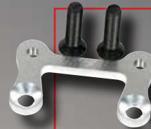
SRC-2810 Left Front Caliper Mount for 10 7/8" Rotor w/Allen Bolts

SRC-2932 Clamp Style Splined Inboard Rotor Mount for 8 on 7" B.C.