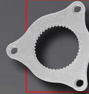
SRC-2701 Splined Adaptor for 6 Pin