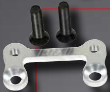
SRC-2800 Left Front Caliper Mount for 10 1/8" Rotor w/Allen Bolts