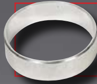
SRC-2931 Inboard Brake Spacer