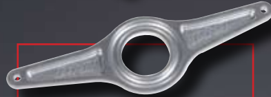
SRC-2075 Aluminum Mount for Half Steering