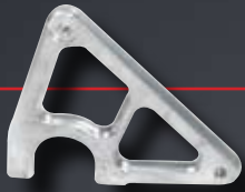
SRC-2080 Combo Steering Arm - Standard

Steering Arms are available in all popular configurations. Please refer to steering arm diagram for any questions.