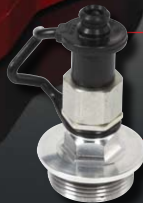
RRC-1909 Threaded Plug w/ Kwik Fill Oil Connector Assy. w/ Covers