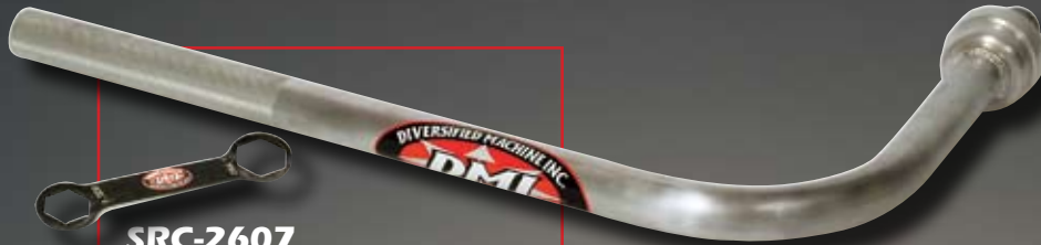
SRC-2607 Rear Axle Nut Wrench w/ L.W. Adaptor

DMI offers a wide variety of tools for specialty applications and everyday use.