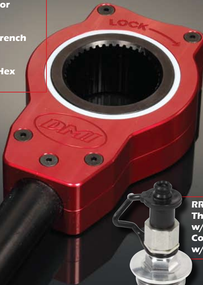
SRC-3000 Engine Rotator Tool